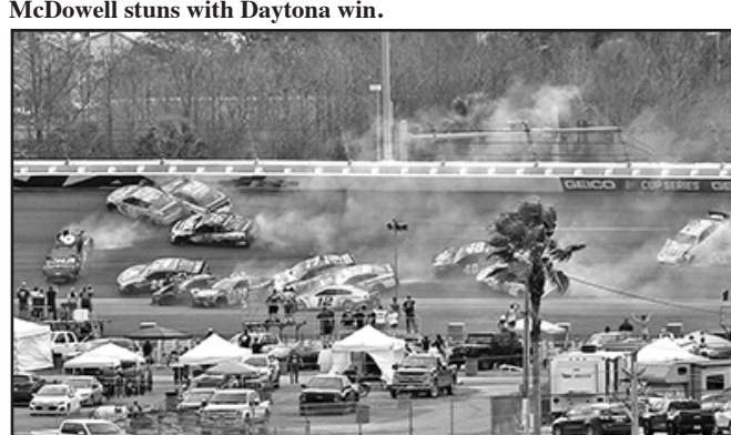
Big wreck on Lap 14.

fitt in a two-lap Overtime shootout to win Saturday's Xfinity